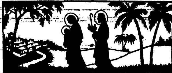
Mary and Joseph Take Little Jesus to the Temple

● TRUE CATHOLIC ACTION IS GIVEN IMPETUS AND DIRECTION BY CAREFUL AND CONSISTENT READING OF YOUR LOCAL CATHOLIC NEWSPAPER.