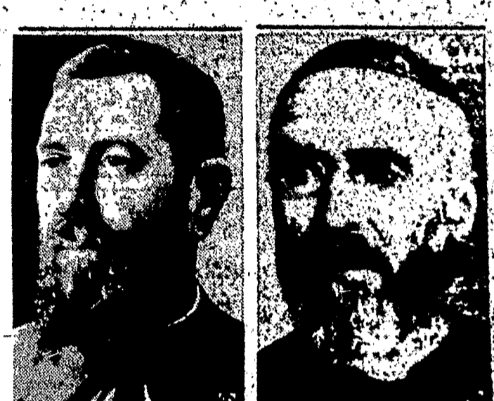
Cardinal Pignatelli di Belmonte