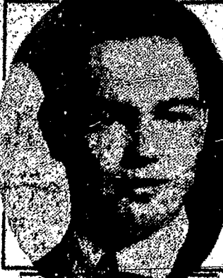
These two graduates of Catholic colleges were recently awarded Rhodes Scholarships.