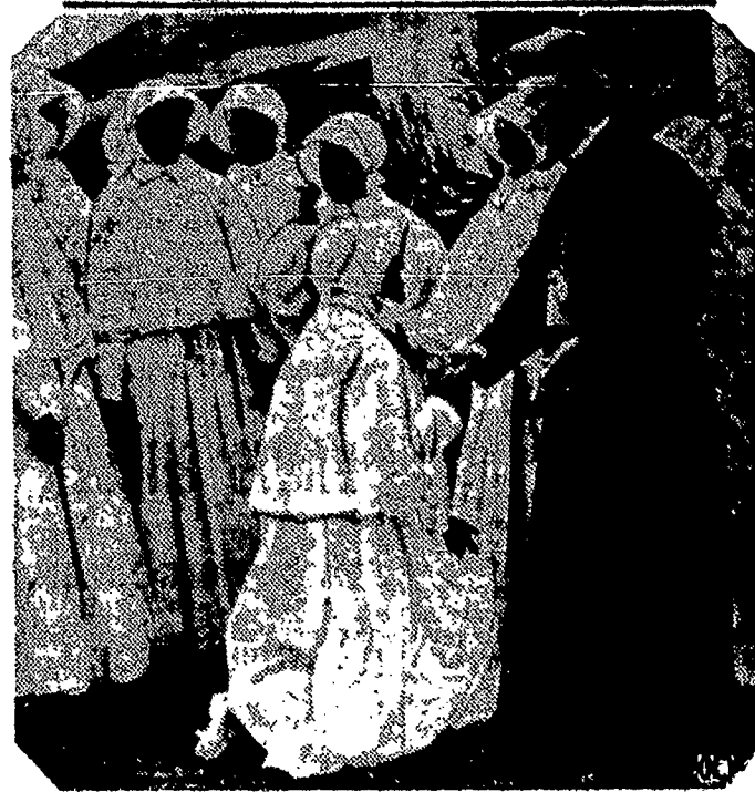
His Eminence Patrick Cardinal Hayes, Archbishop of New York, is shown being greeted by Sisters of Charity upon his arrival at Nassau, in the Bahamas, January 27. Later thousands of children of the Catholic Mission Free Schools there, whose work is supported largely by the Cardinal, participated in a demonstration of welcome.