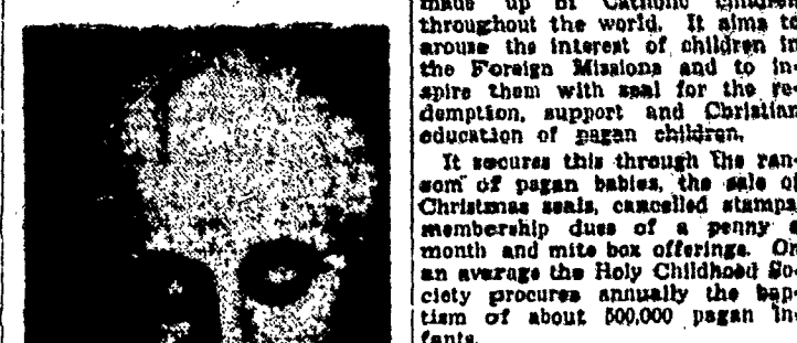
Saint Isaac Jogues