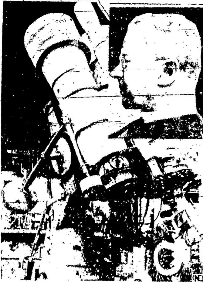
This new telescope, just completed at the Castel Zevio plant in Veneto, Thuringia, by order of His Holiness Pope Pius XI, will be installed in the Vatican Observatory at Castelgandolfo...