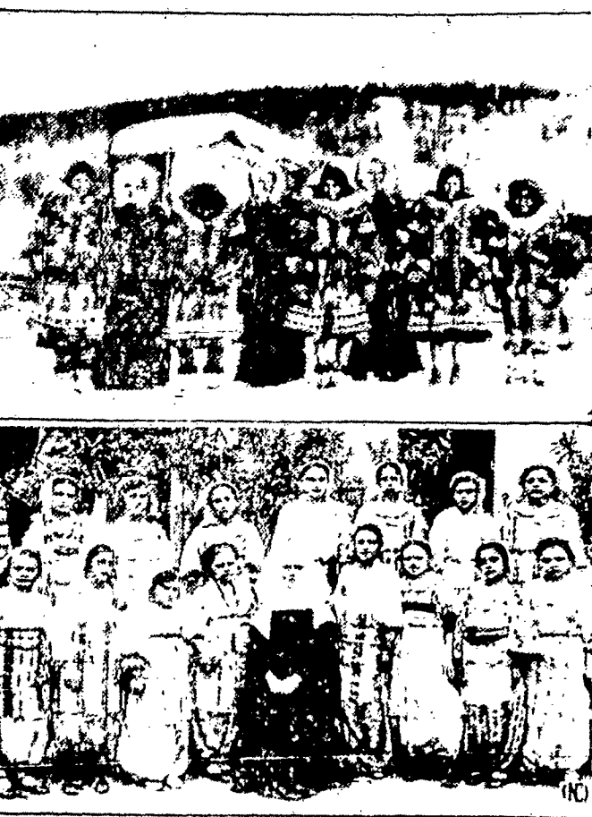
In every land and time, the Church Universal carries on its missionary work. In the upper photo, a group of the 500 of St. Anne, from Lucknow, with one of their Ikonas, at the Natala Mission in Allahabad, Lower photo, how some St. Anne children and the Catholic Sisters, in Southern Yugo-Slavia, in a land once oppressed by the Turk.