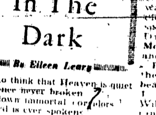
Crying In The Dark