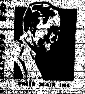
Portrait of a man, likely a cardinal or religious figure.

Mary Burns, Fugitive Nativity on the Bounty The Way Ticket Rendezvous (With Love) Show Them No Mercy Song of the Damned (Changed to "Escape From Devil's Island") Special Agent Sweet Surrender Thanks a Million Two Flirts Without Regret CLASS C—Disapproved for all. Anna Korpena Book to Kiden Barbery Coast Sithere the Great The Devil Is a Woman Dreaming Lips (German) The Firebrand The Girl From Maxim's Gulky Parents High School Girl The Informer Modern Motherhood Morals for Women No More Ladies Narcotic Protect Your Daughter The Scoundrel Smarty Straight From the Heart Trouble in Paradise Unkars Pappan (Bachelor Father) Swedish Unknown Blonde