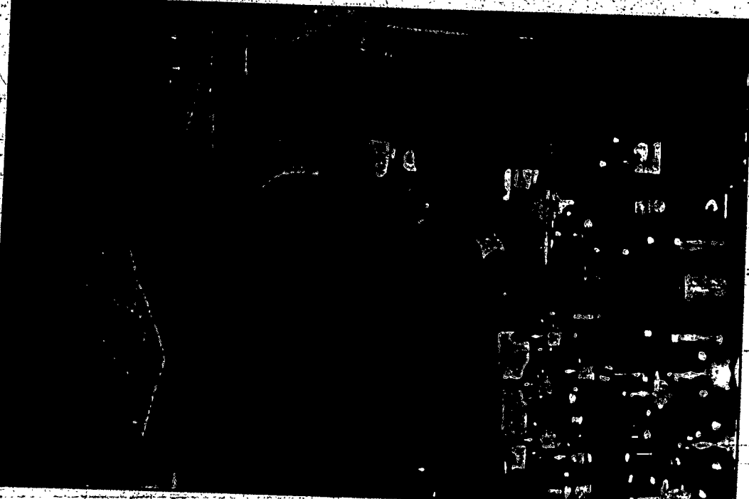
Progress even in old Vatican City. Interested in trends in the sciences, Pope Pius XI here shown inspecting the new printing presses used for the publication of the official Vatican newspaper, Osservatore Romano . The Pope, a contributor to the paper on political and economic questions, is vitally interested in journalism as a means of spreading Catholic Action. Elsewhere in this supplement will be found an article on the Catholic Press Exposition, describing the manifold preparations being made for it throughout the world.