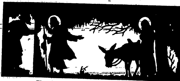
There Was no Room for Them at the Inn