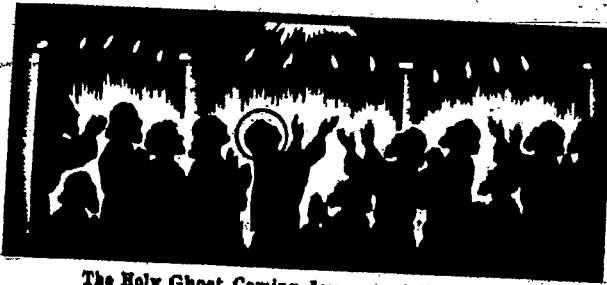
The Holy Ghost Coming down upon the Apostles

1000 CLINTON AVE. NORTH Phone Glenwood 1272