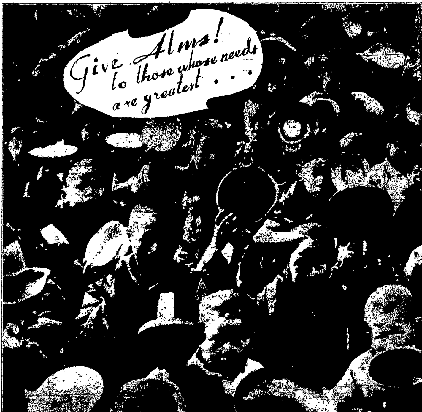
Empty Rice Bowls in Famine-Ridden China. These children and 10,000 other starving people in Yangsu get 2 spoonfuls of rice a day. Starvation! How little even the poorest among us know of it. We hear of millions starving to death in the Orient, but