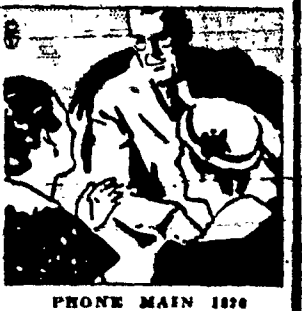
PHONE MAIN 1212

He'll tell you, "Accurate filling of prescriptions (the right ingredients in the right amounts) is necessary to meet the exact requirements of each case." At Paine's you are sure of getting exactly what your doctor ordered for you.