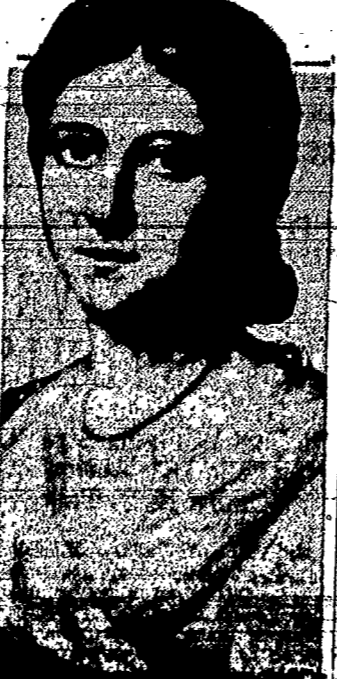
Pauline Jaricot, daughter of a rich silk merchant of Lyons, who in 1820 founded the Society for the Propagation of the Faith, and who has been proposed for beatification. The initial process in her case was begun on February 12 when her body was transferred to the crypt of the church of Saint-Nizier in Lyons. The Society sends subsidies to all Catholic missions throughout the world. The total last year amounting to $3,320,000.