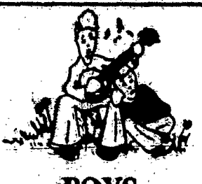
BOYS Their Interests