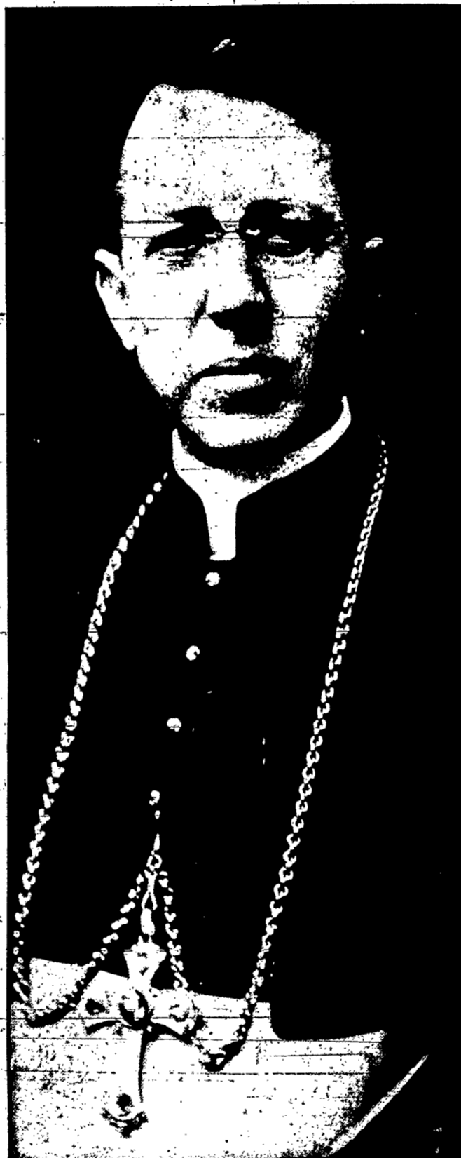
Most Reverend Edward Mooney, D.D.

HIS EXCELLENCY , the Most Reverend Edward Mooney, D. D., who now occupies the throne in St. Patrick's Cathedral as the fourth Bishop of the See of Rochester. Prior to his appointment by His Holiness, Pope Pius XI, as Bishop-designate of Rochester, Archbishop Mooney was Apostolic Delegate to Japan. As Bishop of Rochester, he retains his title of Archbishop "ad personam." Born in Maryland, His Excellency, Archbishop Mooney, claims Youngstown, Ohio, as his home city. He has had a distinguished career since his ordination on April 10, 1909, in Rome, where he completed his theology at the North American College with high honors. He has served as pastor, teacher, spiritual director and became the first American-born priest to receive a permanent appointment to the diplomatic service of the Holy See. Before going to Japan, Archbishop Mooney served as Apostolic Delegate to India. The See of Rochester is honored with another illustrious prelate as "Shepherd of the Flock."