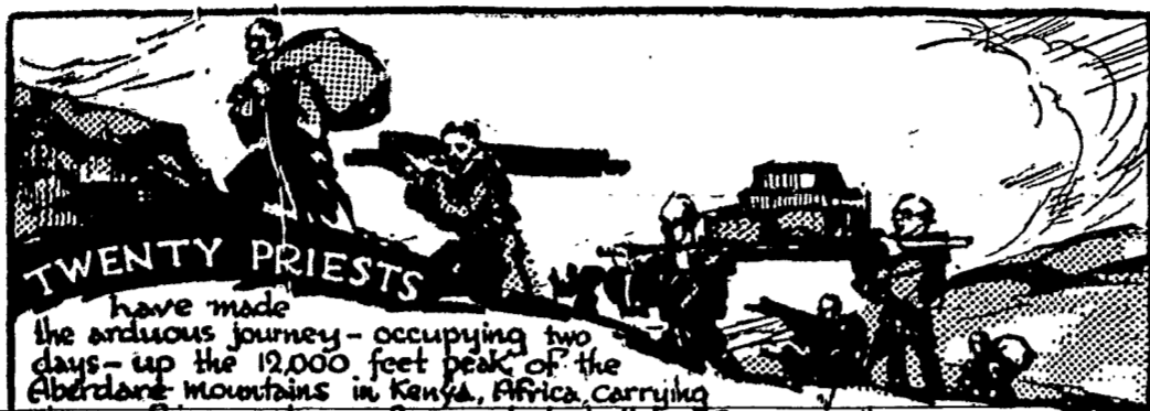
TWENTY PRIESTS have made the arduous journey—occupying two days—up the 12,000 feet peak of the Aberdare mountains in Kenya, Africa, carrying pieces of iron & bags of cement to build a cross on the Summit. The Cross assembled, Mass was celebrated and the territory consecrated to CHRIST THE KING.