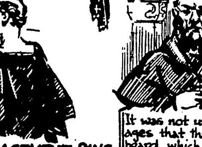
It was not until the early middle ages that the clergy shaved off the beard, which for centuries had been worn by priests & laymen alike. From the twelfth century onwards the rule was generally enforced in the West.