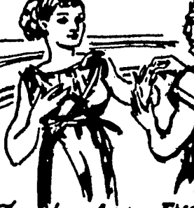
The custom of giving an ENGAGEMENT RING was adopted by the early Christians from the Romans & has continued to our day.

The REPUBLIC OF HAITI IN THE WEST INDIES IS ALMOST ENTIRELY CATHOLIC.