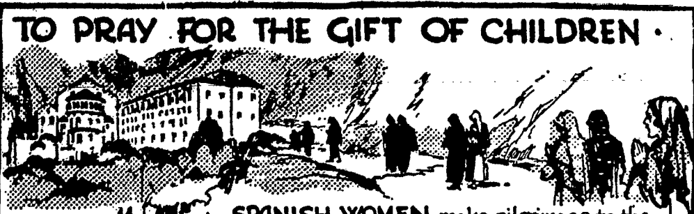
SPANISH WOMEN make pilgrimage to the Shrine of Our Lady of Montserrat in the Pyrenees every December to pray for the gift of children.