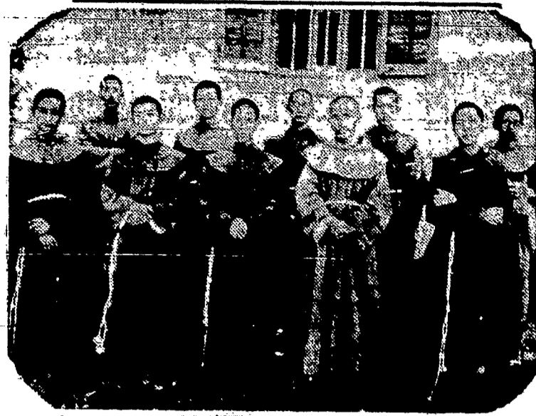
These ten young Chinese were recently invested in the Franciscan habit at the Novitiate in Petchen, an ancient stronghold of the Faith in the Vicariate of Hankow, Hupeh. The novitiate was opened in 1928 for aspirants to the Franciscan Order from the central Provinces of Hupeh and Hunan. Three of the novices shown in the photograph are from the Vicariate of Wuchang, Hupeh, where the American Friars from Cincinnati are laboring.