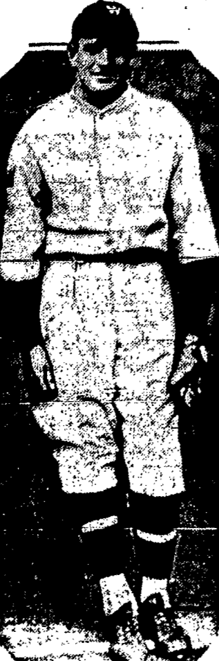
Joe Cronin, youthful star shortstop, who has signed a contract to manage the Washington Senators, succeeding Walter Johnson.