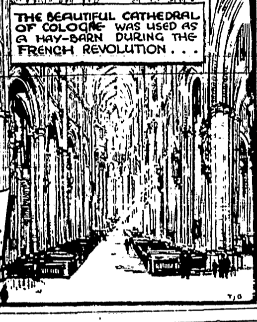
THE BEAUTIFUL CATHEDRAL OF COLOGNE WAS USED AS A HAY-BARN DURING THE FRENCH REVOLUTION . . .

The BUTCHERS OF LIMOGES (FRANCE) belong to a religious corporation founded in the year 930, and the Church of their Patron, St. Aurelian, stands in the street wherein all the butchers' shops are grouped. The affection for animals displayed by many of the Saints has been portrayed down the Centuries. St. ROCH is always pictured with a dog, St. HUBERT with a stag and St. FRANCIS with the wolf he tamed. The symbol of the Dominicans is a dog with a torch in his mouth. Only three earthly birthdays are celebrated by the Church: those of OUR SAVIOUR, OUR LADY & ST. JOHN THE BAPTIST.