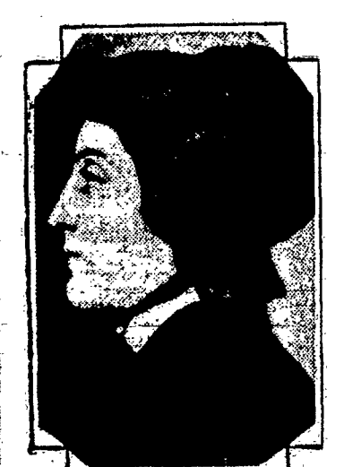
MOTHER ELIZABETH SETON

The tablet at St. Peter's will be the second to be erected in this city to the memory of Mother Seton. A bronze plaque in the Hall of Fame, at New York University, already commemorates her as a writer.