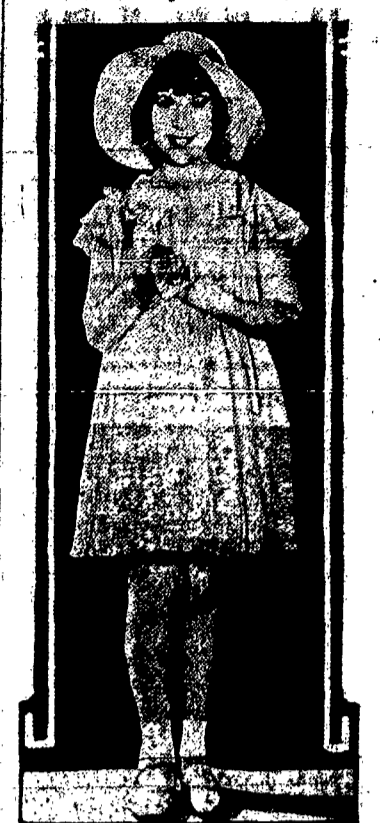
Showing a charming little frock of powder-blue chiffon, posed by a prominent juvenile star in pictures. The outfit, completed with a leghorn hat, is designed for the warmer days.

Paris Sends Summary of Spring Styles for Women News from Paris indicates that the year's style experts have taken into consideration all the varying economic factors that will influence women in selecting apparel for spring and summer.