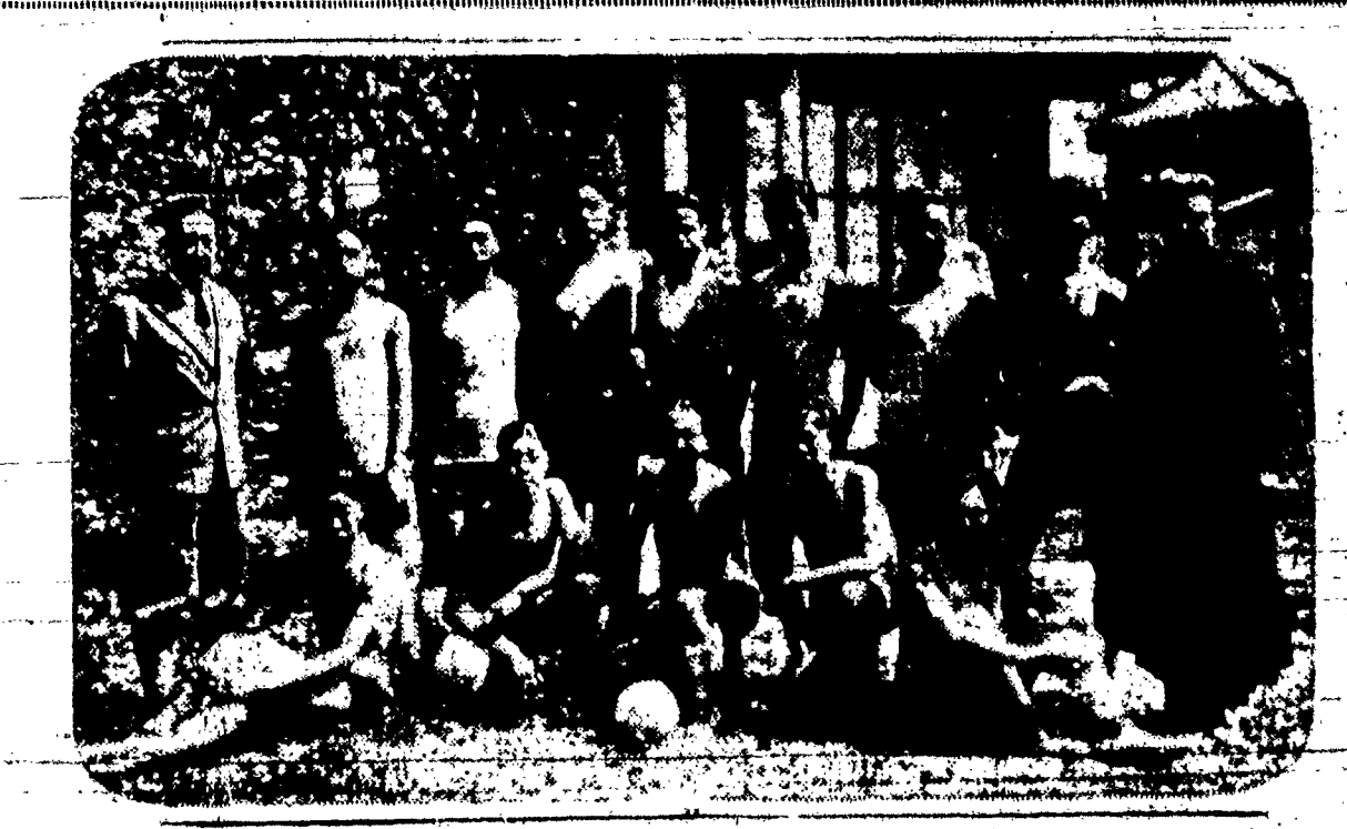
What Notre Dame is to football in the United States, the Catholic University of Peking, China, is to basketball in China. The school is under the direction of the Benedictines, and it has a classy team of basketball boys, well trained and aggressive in their playing.