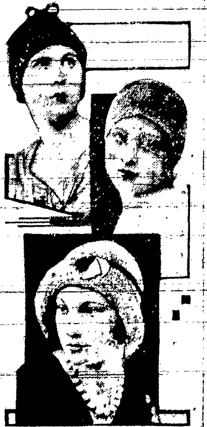
Top—Black satin toque with satin ribbon trimming woven through net. Center—Evening cap of gold pearls with a veil to match. Bottom—White and blue Japanese straw hat with an upturned brim. It is trimmed with grosgrain ribbon.