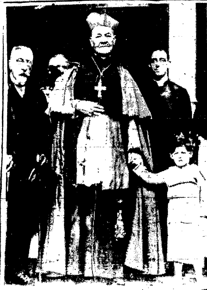
The last picture taken of Vincenzo Cardinal Vannutelli shows him at an episcopal outing in Rome. He died on Wednesday of last week and was buried on Saturday.