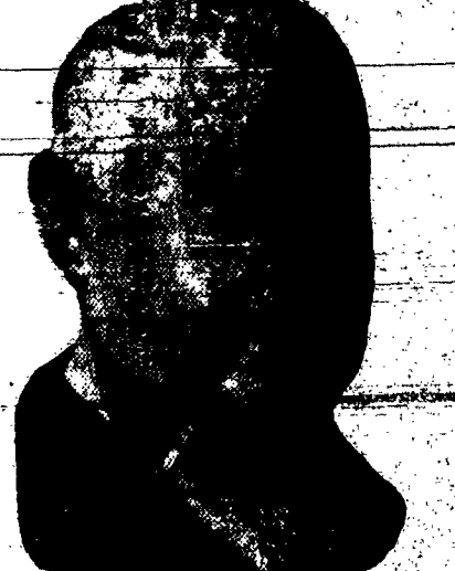
WILTON LACKAYE After an illness of two years Wilton Lackaye, the grand old man of the American stage, has recovered. Mr. Lackaye is one of the organizers of the Catholic Actors' Guild, and he is known and beloved throughout the land.