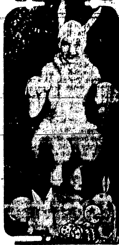
Who said rabbits don't lay eggs? This young lady seems to have a bit of weighty evidence to prove that they do.