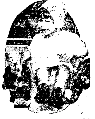
This little maid is all prepared for Easter, with her basket and "bunny."

(By N. C. W. C. News Service) Moscow, April 11.—Doctors in Soviet Russia will not be allowed private practice in future, according to the latest ruling of the Health Commissariat. Patients must receive all treatment from State doctors. Those not classified as workers will be charged a special fee. The move was caused, according to current talk in Moscow, by the fact that there is a dearth of young medical students in Russia. It is believed the barring of private practice will act as an inducement to many young men to study medicine for State service. The Catholic Courier and Journal is the Official Catholic Paper of the Diocese of Rochester, Published in Rochester by Rochester People.