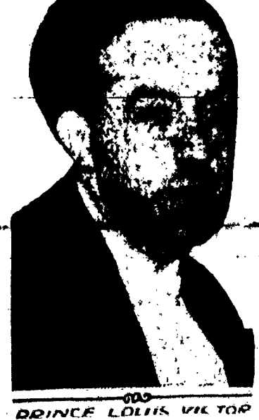
PRINCE LOUIS VICTOR

The only Catholic winner of a Nobel award this year is Prince Louis Victor, pictured above.