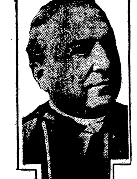
CARDINAL PIETRO GASPARRI