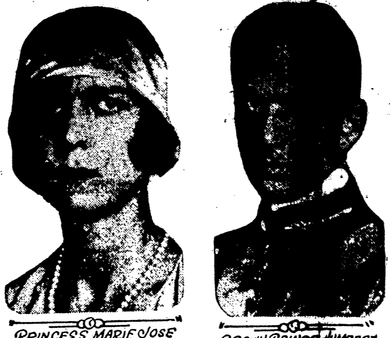
PRINCESS MARIE JOSE OF BELGIUM and CROWN PRINCE HUMBERT OF ITALY