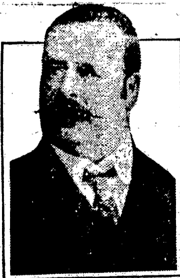
SIR JOHN WARD

Many decades ago the British government used to transport liberty-loving Irishmen to New Zealand. Now one of them rules the country. Sir John Ward, the new Prime Minister of New Zealand, Australia, too has a Catholic Prime Minister.