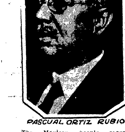
PASCUAL ORTIZ RUBIO

The Mexican people recently elected Pascual Ortiz Rubio as President of their country. He has had a great deal of experience in politics, and is considered a capable man. Stories circulated during the campaign that the Church opposed his election were promptly denied by Church officials in Mexico. On the other hand, an era of peace and tolerance is expected during his administration.