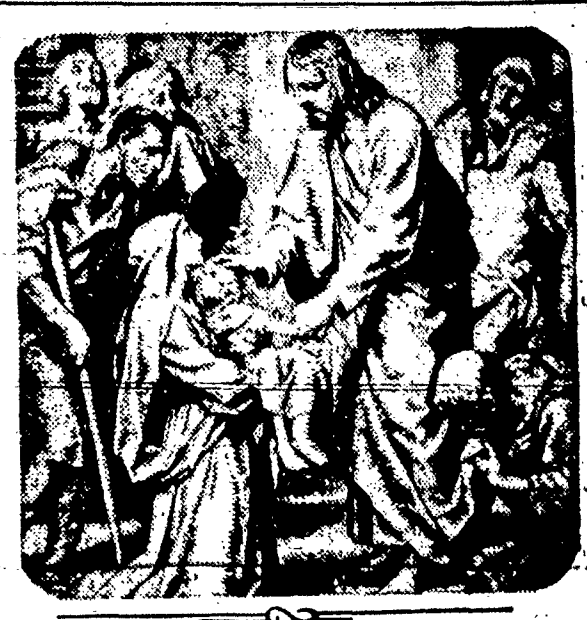
In the second picture Christ is shown going about His mission of mercy and love. He spent His time with preaching and bringing happiness to others. In this instance He is shown rubbing His finger on the eye of a blind man's eye.