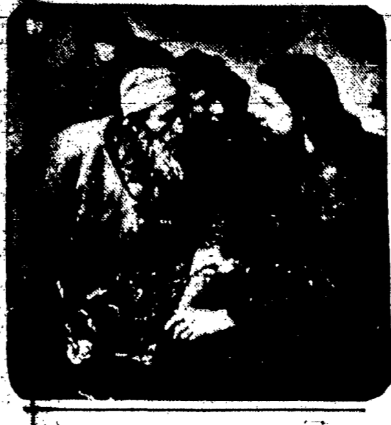
Today's gospel, like most read at Mass, is an evangelist's version of what Christ said to His disciples. In this illustration the poor fishermen who later to carry Christianity to all the known world are shown intently listening to what the Master says.