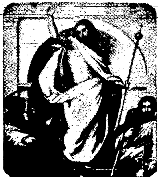
The first Sunday of Advent is the first Sunday of the ecclesiastical or Church new year. The gospel for the day, as is every gospel read during the year, was written by one of the four evangelists—Matthew, Mark, Luke and John. They are pictured here with the Risen Christ.