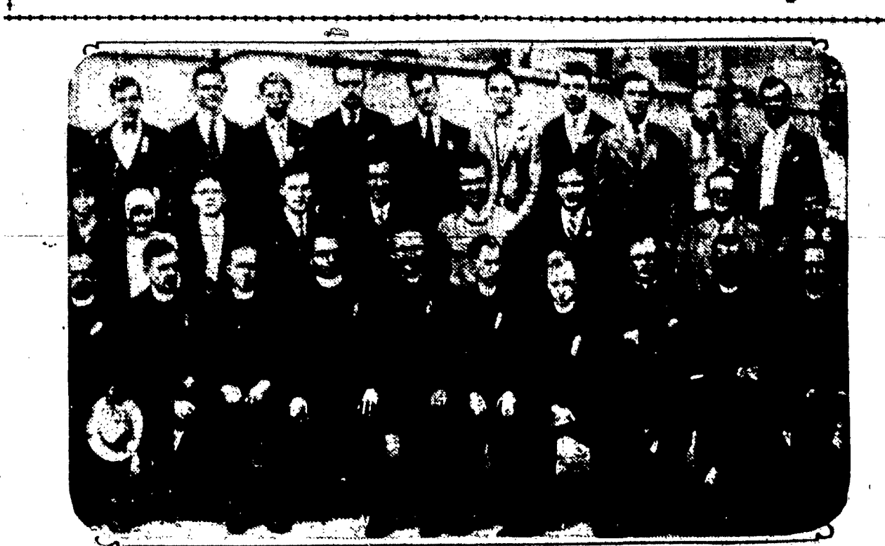
One of the growing organizations of students in America is the Catholic Slovak Student Fraternity, which now has a membership of more than one thousand young men and women. Pictured above are the Directors of the society and some of the student delegates at the eighth annual convention of the organization, held recently in Detroit.