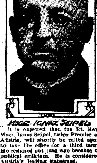
Msgr. Ignaz Seipel. It is expected that the Rt. Rev. Msgr. Ignaz Seipel, twice Premier of Austria, will shortly be called upon to take the office for a third term. He resigned not long ago because of political criticism. He is considered Austria's leading statesman.