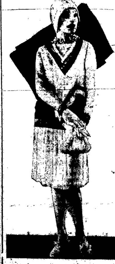
Cocou crepe fashion this spectator sports frock. The modermittie pattern in midnight blue and garnet on the lower part of the blouse is repeated on the neckline, and the white silk accented with a silver sequin, completes the costume.