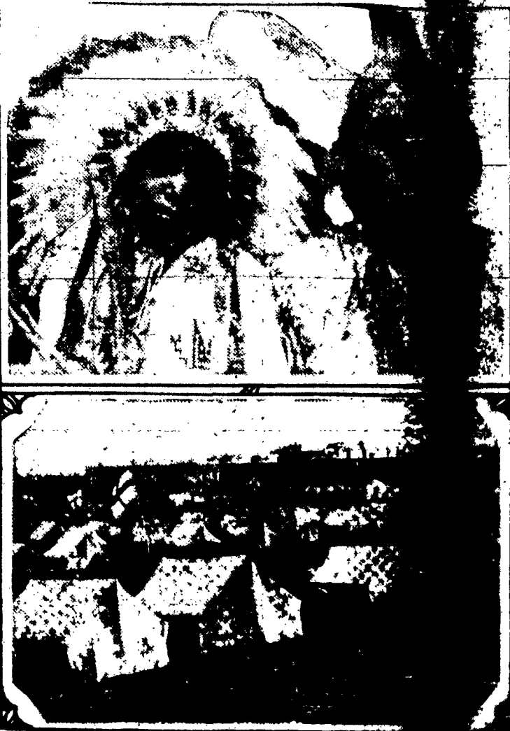
Catholic Indians at their encampment at Mt. ... voted to abolish the suggestive Rabbit Dance.