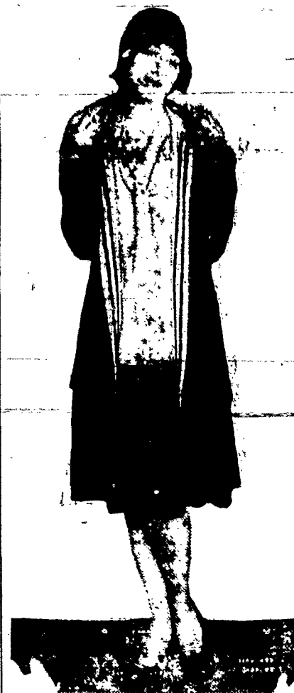
Black Satin Jacket Suit Showing Piping of Black on Collar.

—The colors are pleasing and bright and have become very popular. The colors included are red, light green, blue, tan and yellow. Priced as follows: