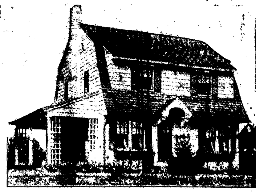
An Abundance of Sunshine Will Always Make Cheerful Rooms Within This Charming House for Though Attractive Shutters Ornament the Windows They Will Always Be Opened Wide to Admit the Light and Air.