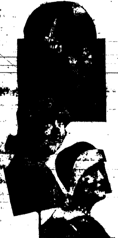
A Model in Two-Toned Straw. A Straw-Like Cloth Model With Veil. A Straw Model in Black and White.