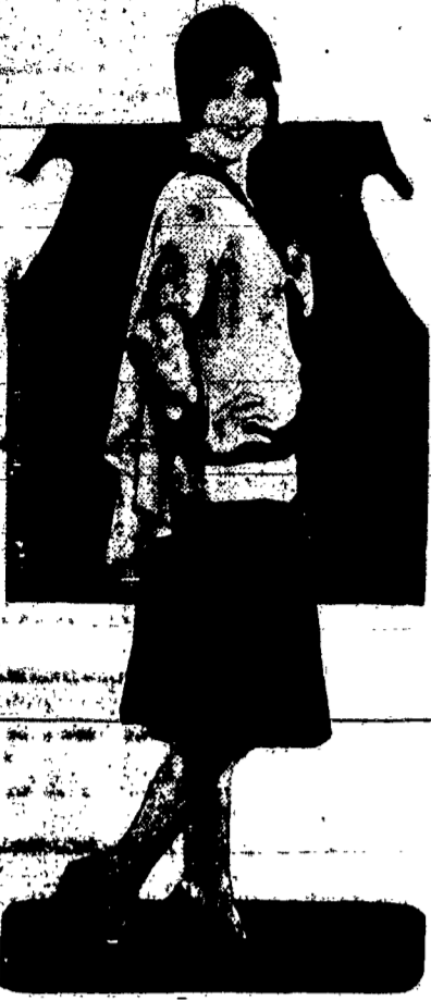
A black-and-white costume idea for your "midday" spring wardrobe. The blouse shown in the picture shows a cape back, while the black hat is circular. Black hat, black gloves and white hose complete the outfit.

White Blouse Trimmed in Black; Cape Back