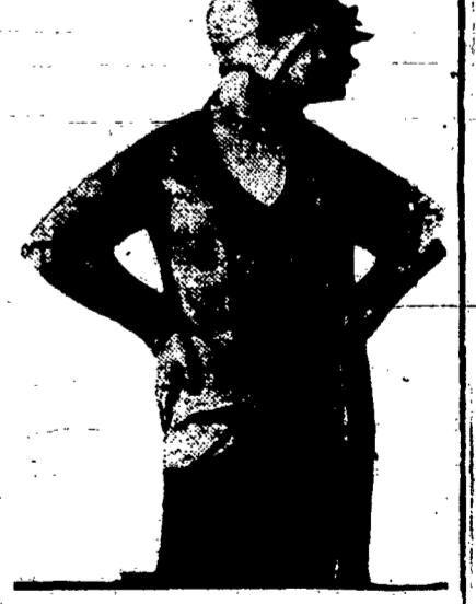
Showing a very smart and distinctive tailleur ensemble of gold rayon crepe and black rayon crepe which features a new note in jackets—the cut-away effect.