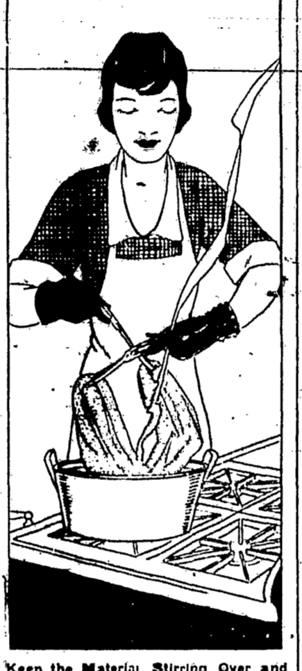
Keep the Material Stirring Over and Over.

Time was when you could recognize the flour bag garment hanging on the line by the faint outline of the trade mark and by its creamy color. Nowadays women not only take pains to get out all the inked stamping, but have become so skillful with the dye-pot that they can produce the most charming colorful articles whose flour bag origin is positively beyond detection.