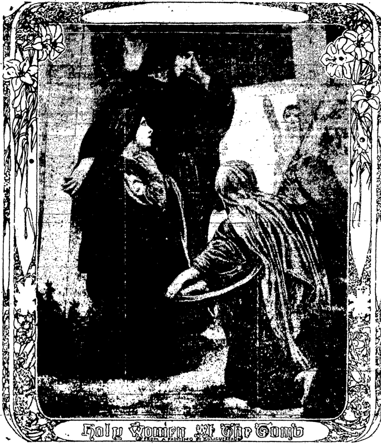
Holy Women at the Tomb