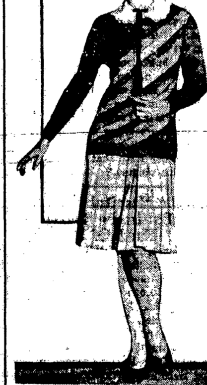
For school wear, a silk knit sweater of novel diagonal weave and a pleated skirt of flannel make an ideal outfit...