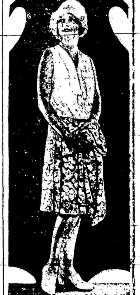
Pussy Willow Street Frock for Spring and Summer.