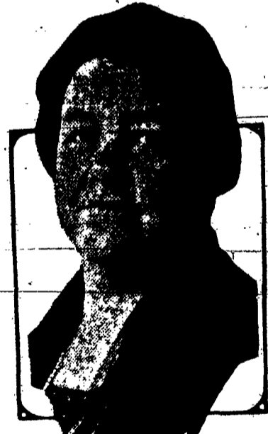
Mrs. Mary T. Norton Mrs. Norton is the Representative of a New Jersey District, and is proving herself an able capable and official.