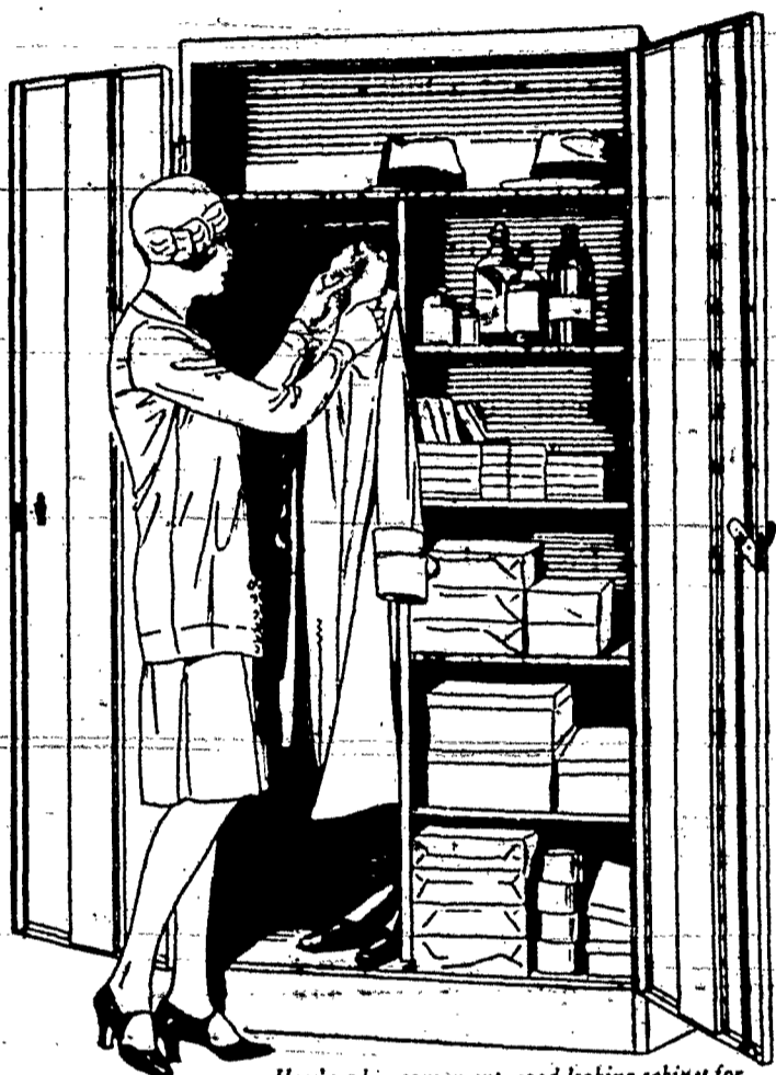
Here's a big, convenient, good-looking cabinet for the hats, coats, umbrellas, stationery and other odds and ends that clutter up the average office.