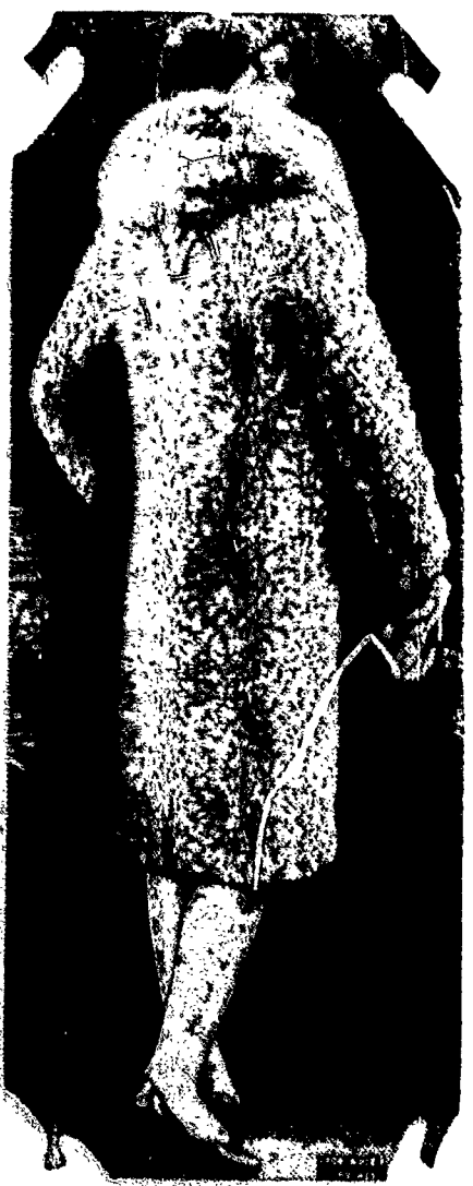
Here is shown an exceedingly smart fashion designed for the coming winter and which is sure to have many admirers. It is a gray karakul coat with a collar of soft gray fox.