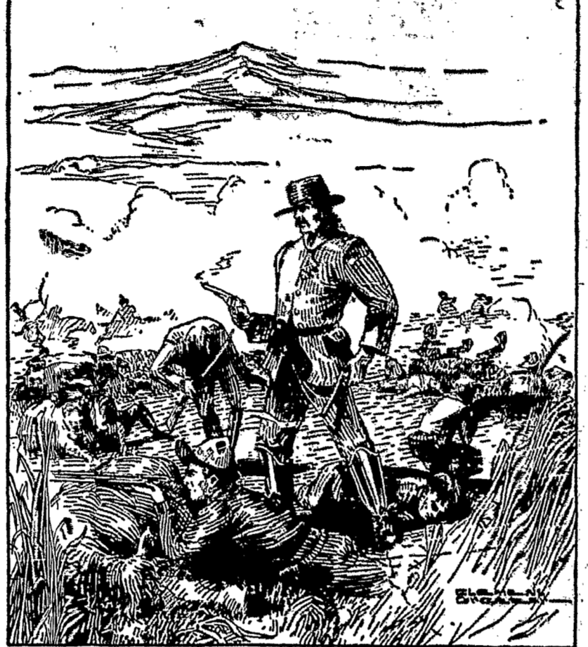
General Custer's last fight (1876). Find the Indian chief.