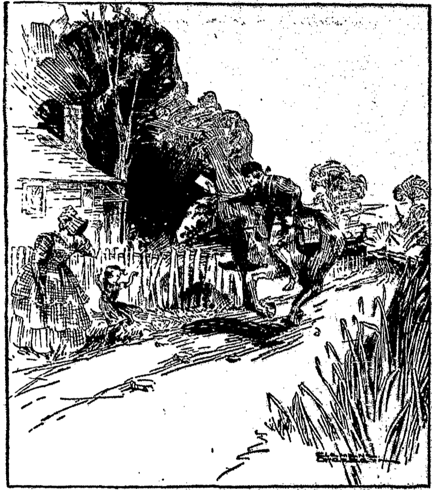
The mail carrier of colonial days. Find a modern carrier.

Solve these Pictures on American History Each Week American History Puzzle Picture