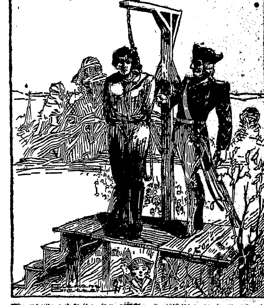
The execution of Nathan Hale (1776), who said before his death: "I only regret I have but one life to lose for my country." Find a word hidden in the illustration telling of the reason for his supreme sacrifice.